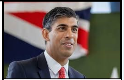
Conservative Party Leader Rishi Sunak