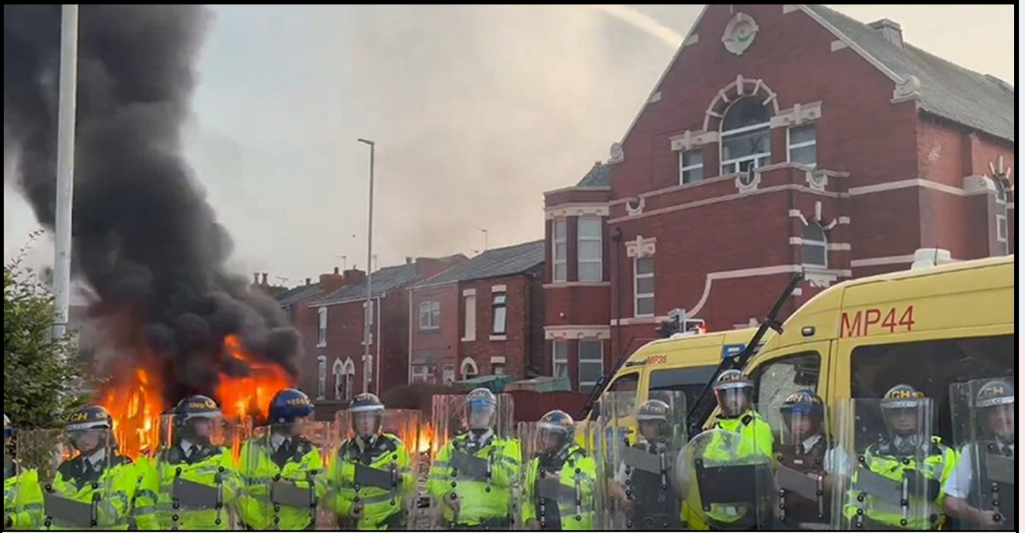
Riot Police in Southport, Merseyside. A riot broke out on Tuesday 30th July, in response to the murder of three girls on Monday 29th.