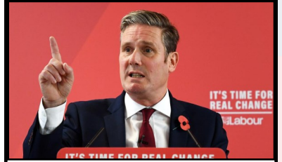
Labour Party Leader Kier Starmer